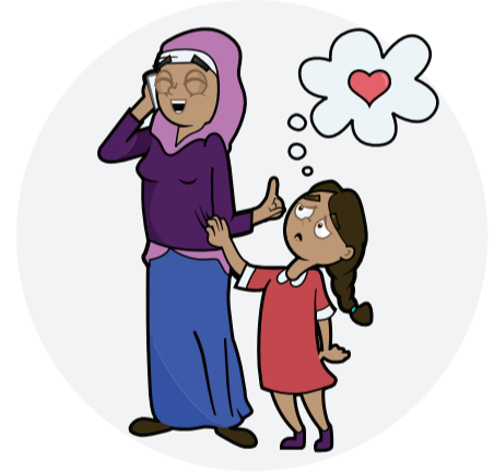
Depriving a child of love and attention