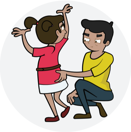
Touching a child's private parts