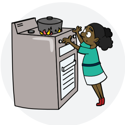
Leaving a child without supervision