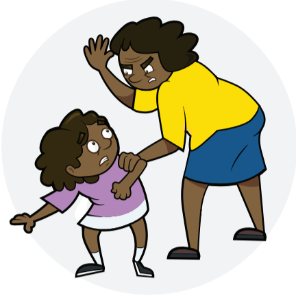
Hitting or hurting a child physically