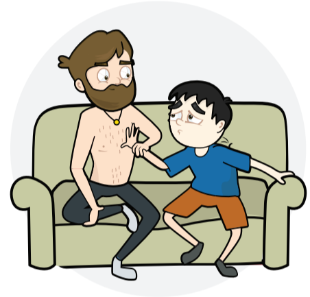
Forcing a child to touch you