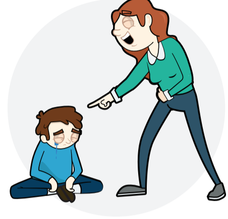
Teasing or humiliating a child