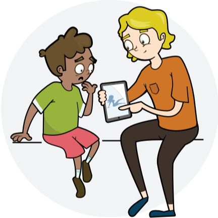
Showing pornography to a child