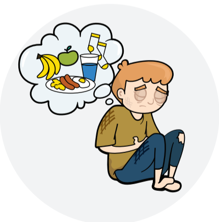
Not providing adequate food, clothing or medical needs for a child