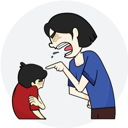
Yelling at or threatening a child