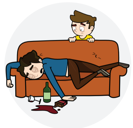
Being intoxicated in front of a child